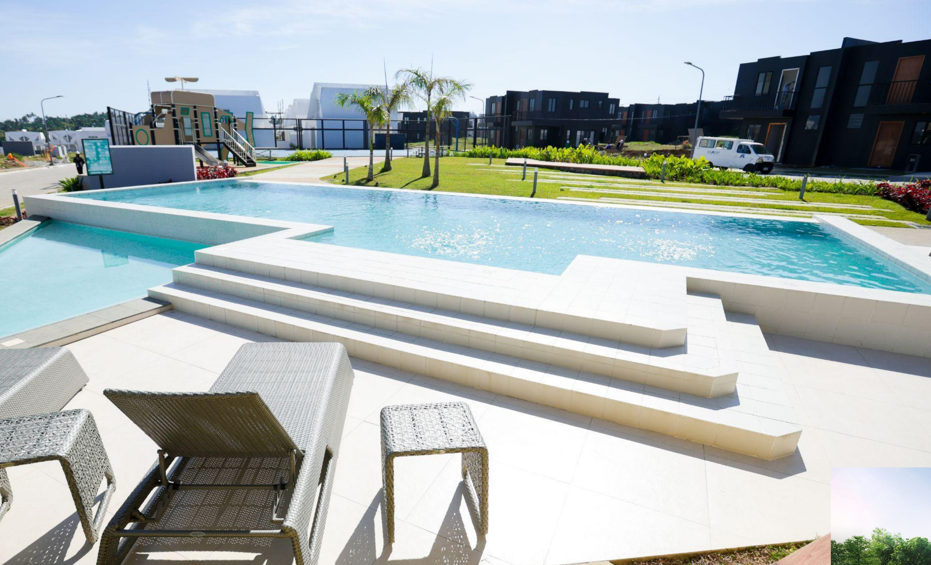
Swimming Pool (actual photo as of March 2024)