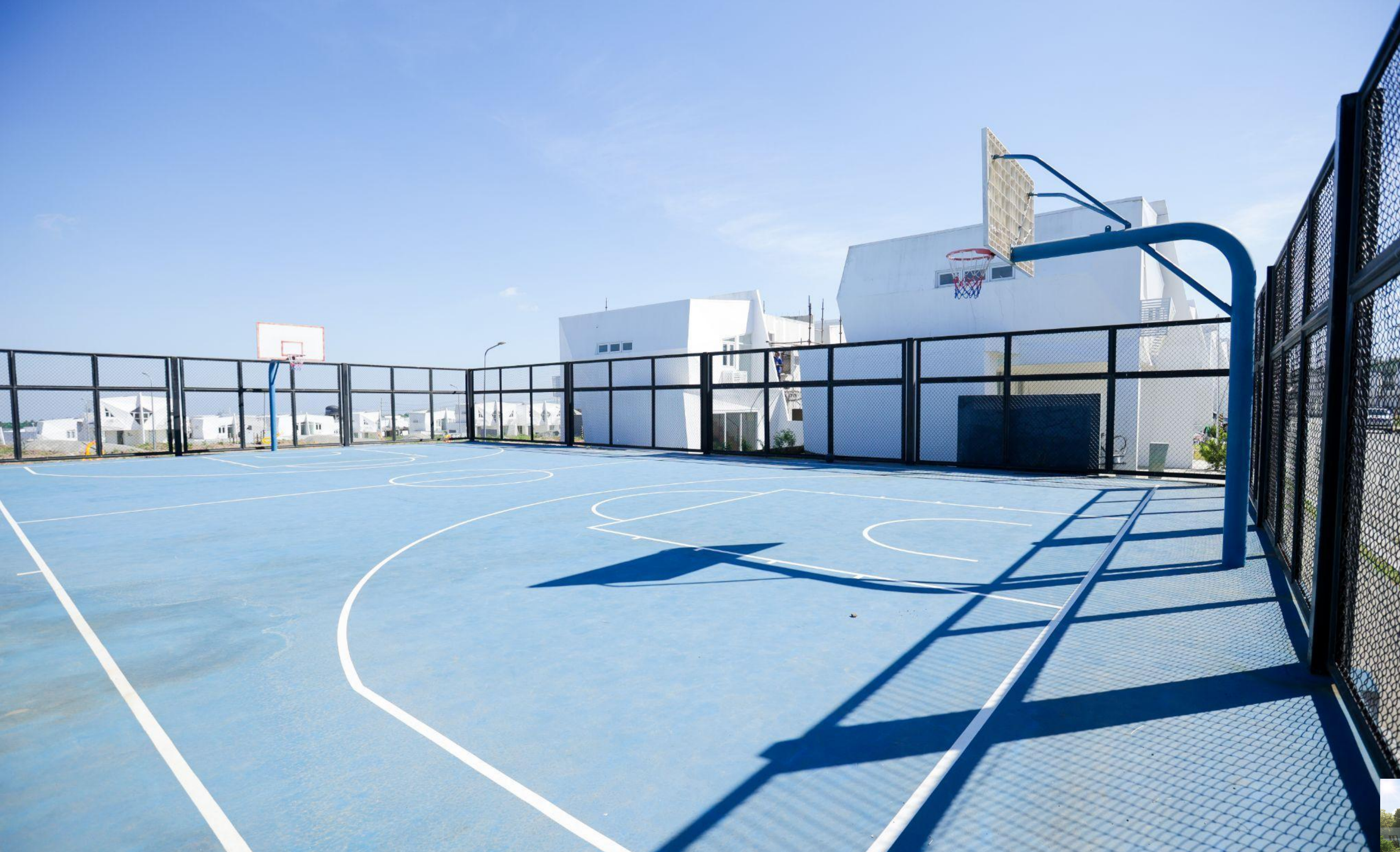
Basketball Court (actual photo as of March 2024)