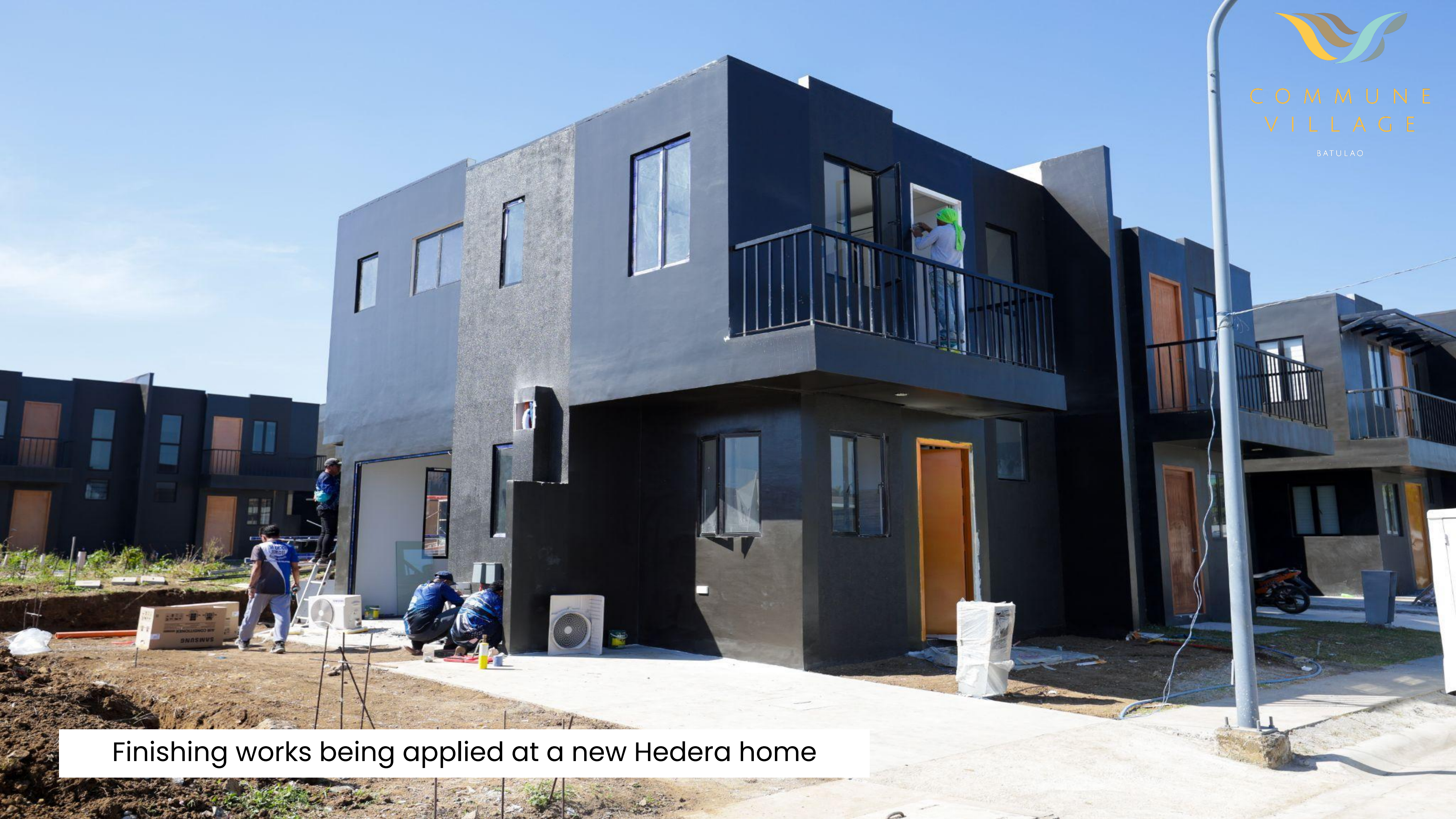
Finishing works being applied at a new Hedera home