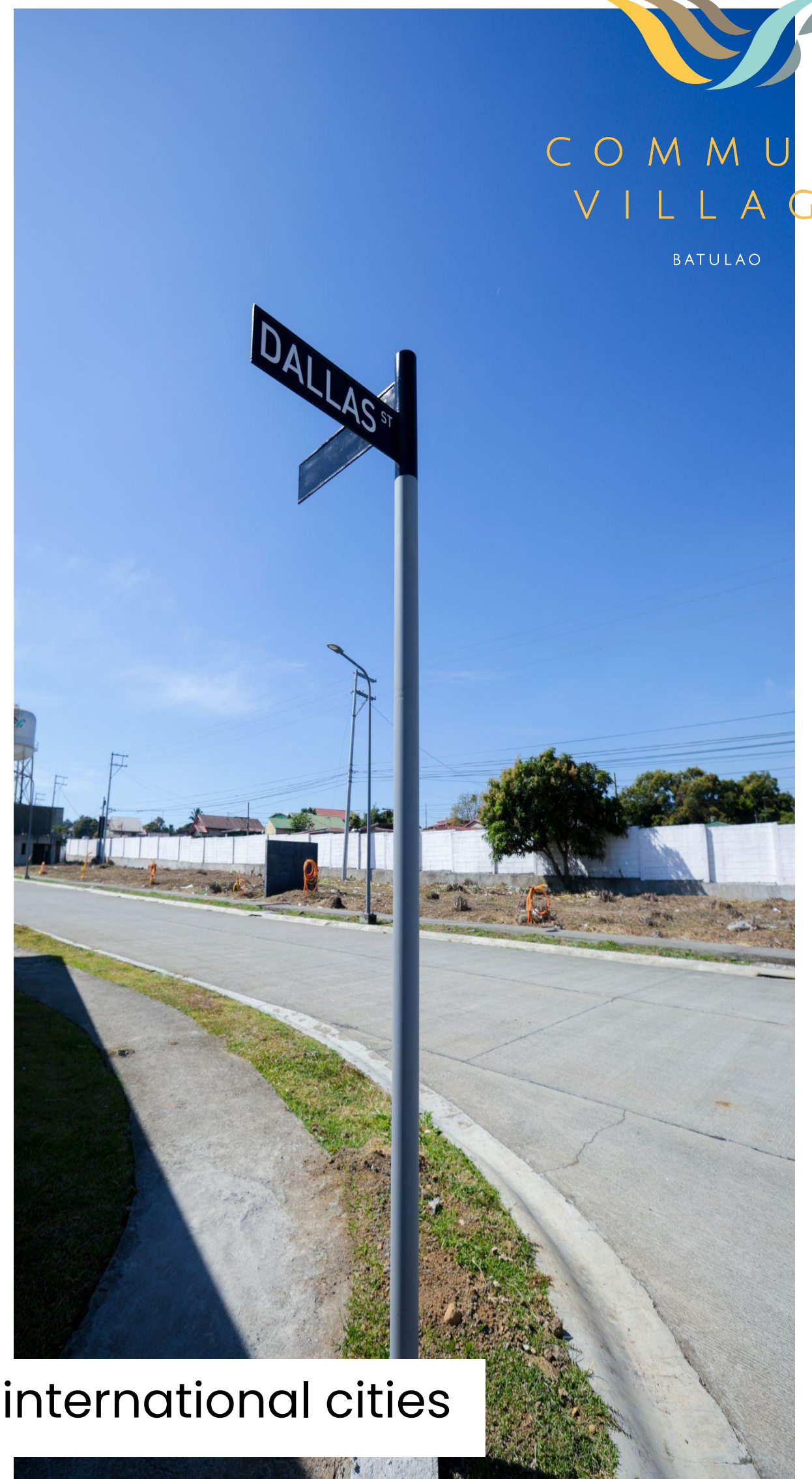
Street signs in the village - names inspired by popular international cities